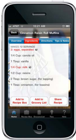
Recipe with Allergens